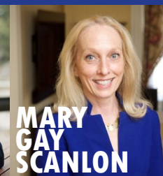
MARY GAY SCANLON